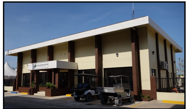
BEL's New San Pedro Branch Office